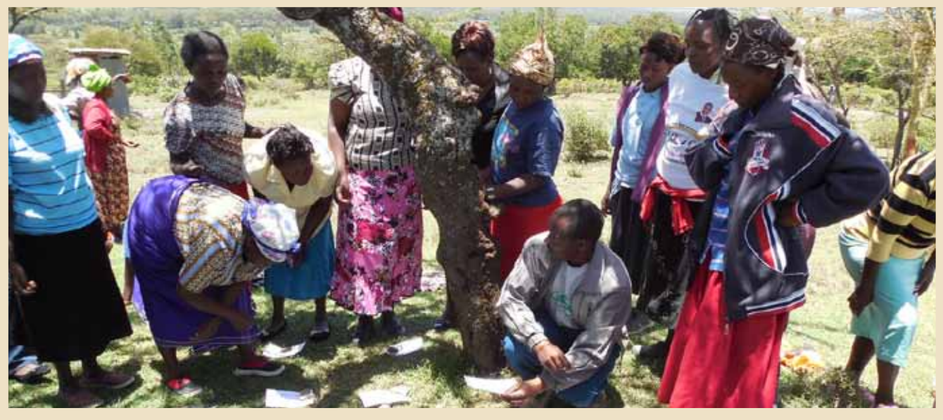
SAPA meeting with representatives from the community

A SAPA "facilitation team" has recently been established – three representatives of local communities and three members of OI Pejeta staff – and discussions with local communities will start in mid March. Through this newsletter we will keep you updated on the progress of this work and the results as they come out. We believe that this work will enable OI Pejeta to reach poorer people and get the best out of its social impact hence achieving more in its role as an engine for development in this part of Laikipia County.