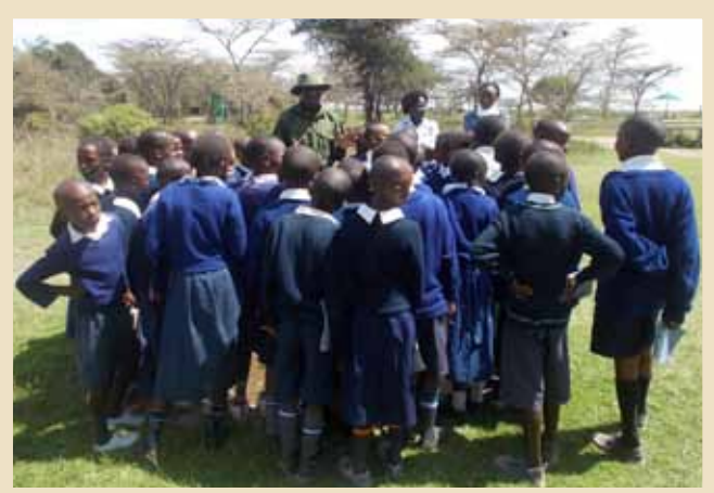
Students on a game drive on the OI Pejeta Conservancy stop at the Morani Information Center to listen to a talk from one of our rangers

The Conservancy has plenty to offer. Not only do children enjoy game drives around the Conservancy, but also the Morani Information Centre and the Sweetwaters Chimpanzee Sanctuary provide a huge opportunity for school children to learn more about current conservation efforts as well as gain a deep knowledge of the wildlife species found on OI Pejeta Conservancy.