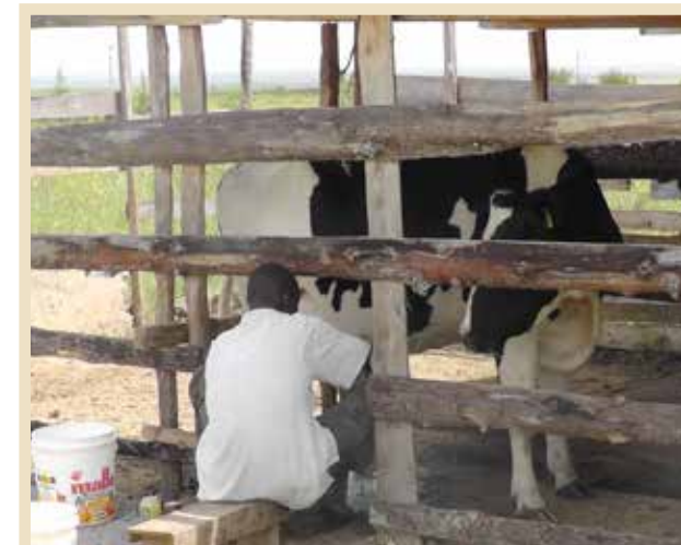
Dairy cows provide schools with milk to supplement the children's diet

In June 2012, thanks to sponsorship worth Ksh 1,000,000 (US$ 11,630) from our partners Project Kenya Sister Schools, we were able to purchase dairy cows and biogas equipment for four neighbouring secondary schools. This was one of the most rewarding projects I participated in last year. By providing nutritional support to students, OI Pejeta came one step closer to its goal of improving literacy levels in the community.