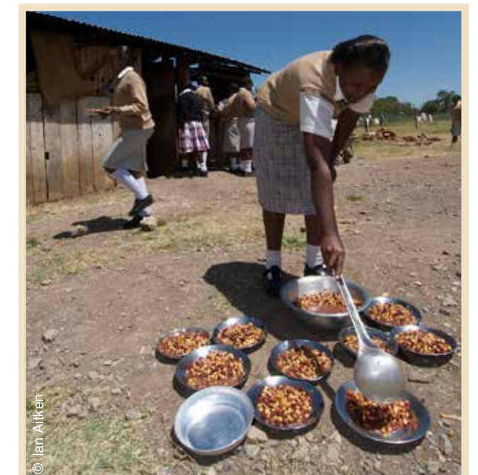
By providing nutritional support to students, OI Pejeta is one step closer to its goal of improving literacy levels in the community

With just two dairy cows, our neighbouring schools are able to generate eco-friendly fuel and produce enough food to feed all their students. I'm encouraged by the success of this project in these four schools and can't wait to implement it in other schools.