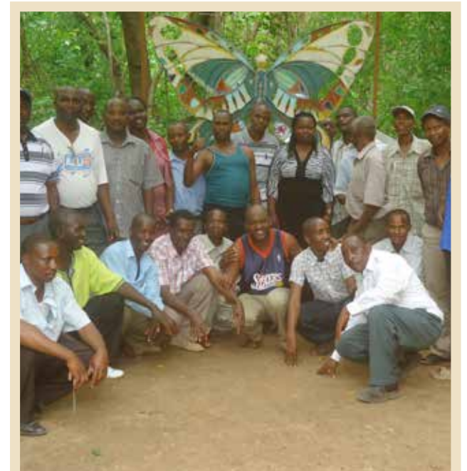
32 local community leaders were taken on an exposure tour to learn from other successful projects in the country

We had a number of training sessions during the year. The first one, facilitated by Acacia Consultants, brought together community representatives from all neighbouring divisions of the Conservancy to discuss improvement of services in the area. A few months later, 32 community leaders were taken on an exposure tour around the country to learn from other successful community projects among them the Kipepeo Butterfly Farm, Amboseli National Park and Ndovu health centre in Voi. The leaders learnt about using locally available resources to empower the community, mediating human-wildlife conflict cases and getting community assistance is conservation among other relevant topics. The tour was a resounding success with the leaders getting inspired to share what they had learnt with their community members.